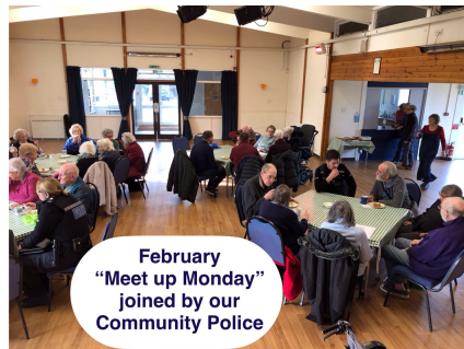
February “Meet up Monday” joined by our Community Police

There are often comments from visitors, saying what a lovely village we have and a strong community spirit. It is true that Stutton has a host of natural “assets” - Stutton Ness, Alton Water, Farmland, Woods, the beautiful Church, primary school, community shop, almshouses and our community hall all enhanced by our village’s community spirit. This spirit is not by chance, luck